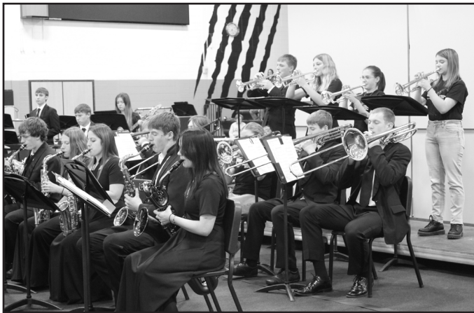
Jazz 1 presents the song "Hooked on The Holidays."