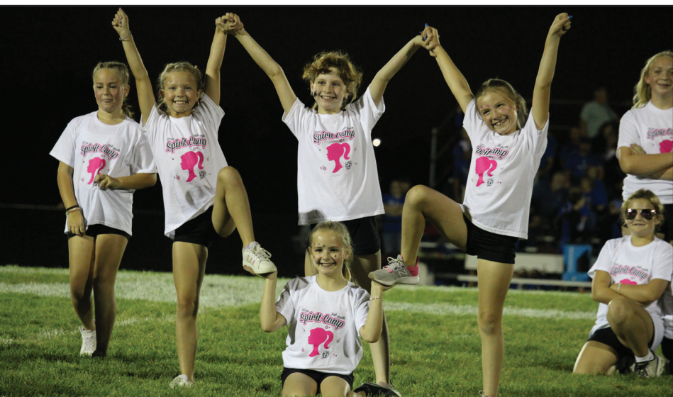
The young dancers got together and posed after their performance.