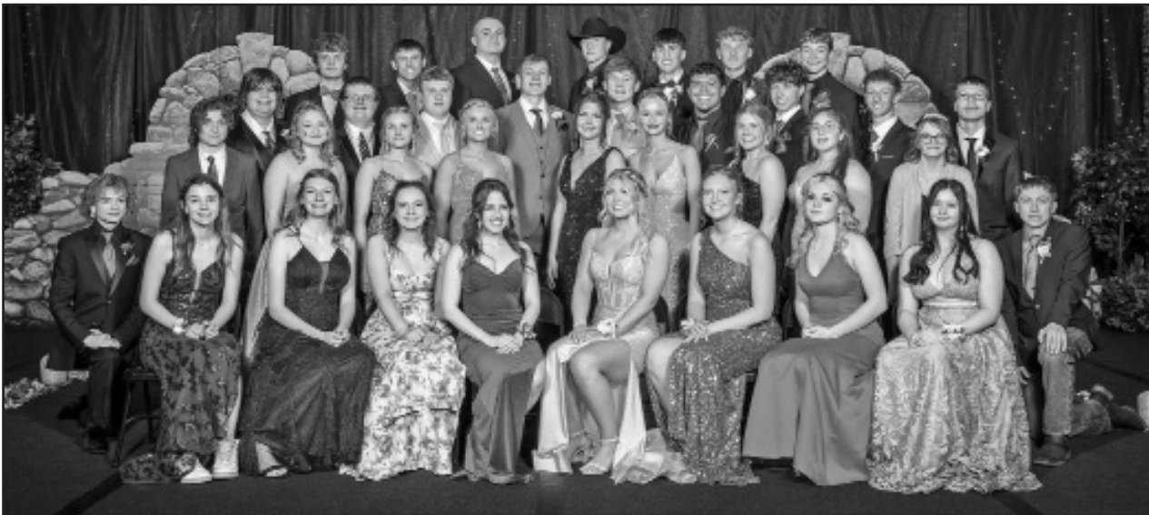
The Class of 2025