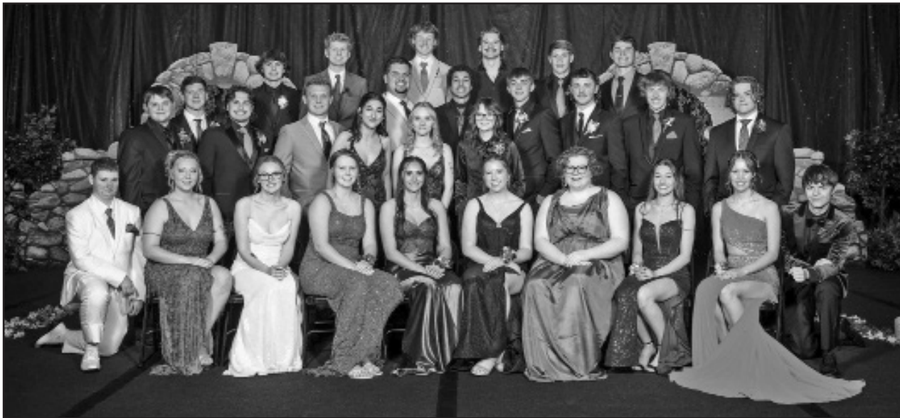
The Class of 2024

South O'Brien High School juniors, seniors, and their dates celebrated Prom on Saturday, April 27. The west gym was decorated using Disney's fairytale Tangled as the theme. Students walked the Grand March through pathways lit by lanterns and decorated by a forest of trees and vines. Following the Grand March, students gathered for couple and group pictures and danced the night away from 9 pm to midnight. Students attended the After-Prom Party from 12:30-4:30 am. The fun included five inflatables, mini-golf, bag games, card games, and an entertaining hypnotist. The night was truly a fairytale for all those who went to Prom.