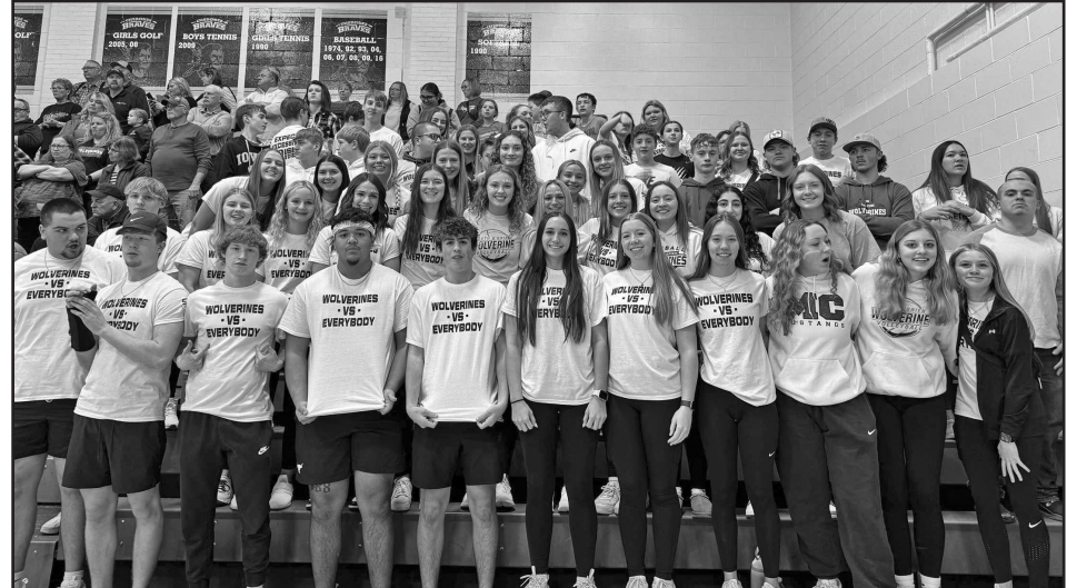
The South O'Brien fan club shows off their new student section shirts.