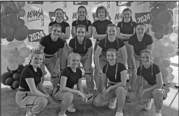
South O'Brien dance team after a successful State Dance performance in Des Moines on November 30.