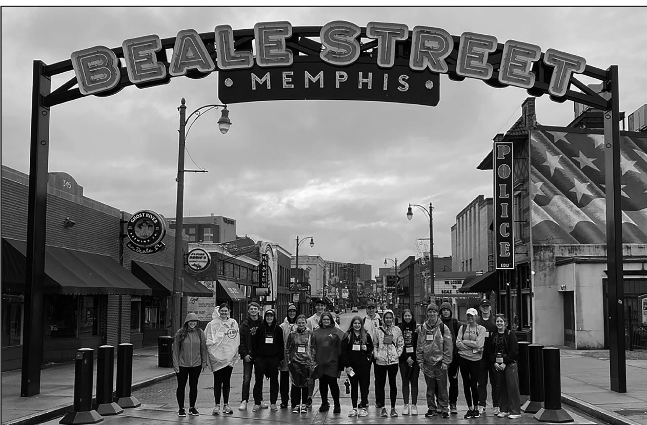
South O'Brien students explored the famous Beale Street while in Memphis.