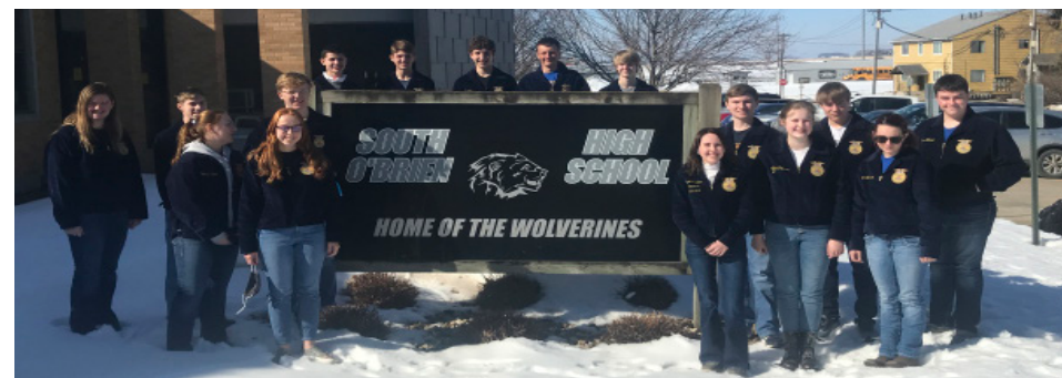
South O'Brien FFA members dress up in their FFA jackets on Jacket Day.